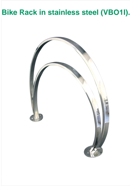
Bike Rack in stainless steel (VBO11).