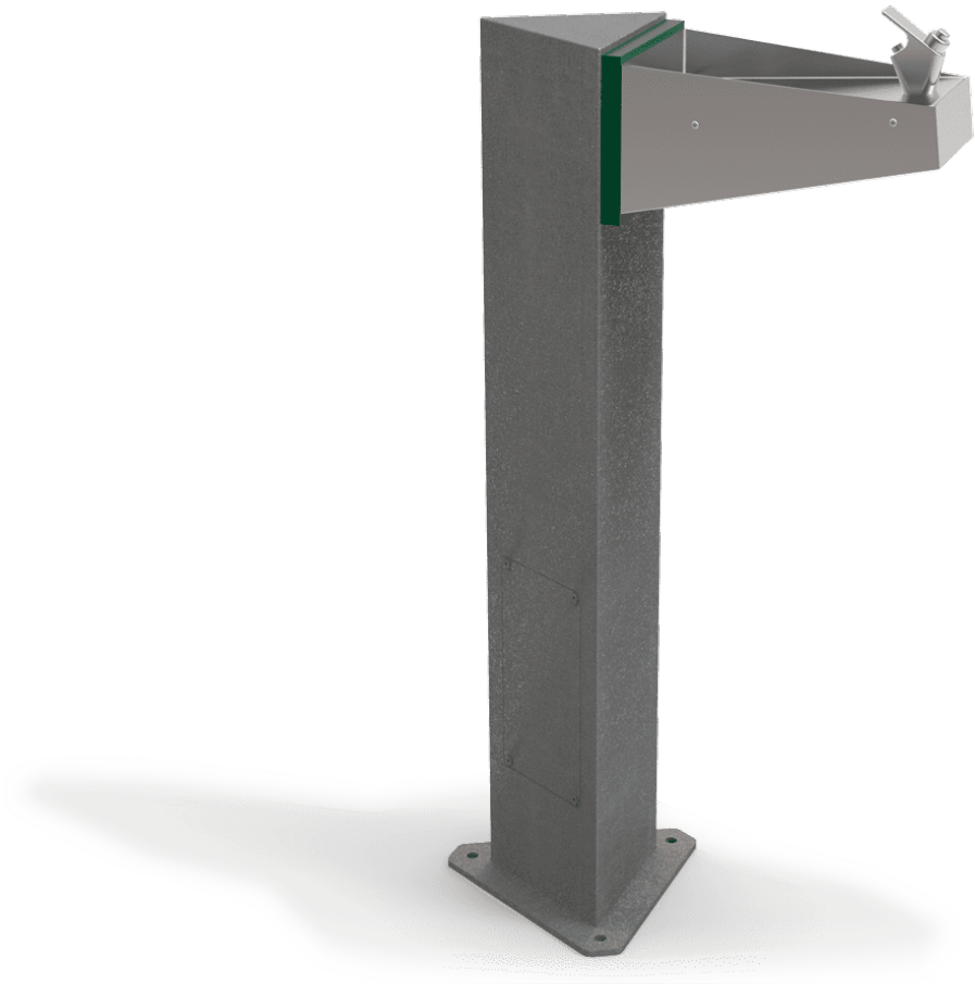
Fountain with triangular column in steel treated with Ferrus, a protective process that guarantees high resistance to corrosion.